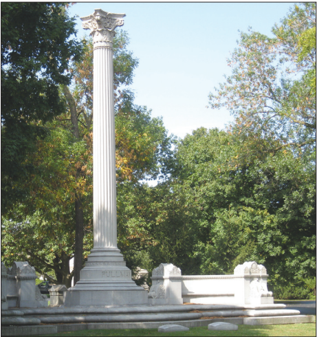
The towering pinnacle atop George Pullman's grave belies what's underneath - tons of rails, cross ties and concrete to keep his angry employees from digging up and desecrating the controversial industrialist's corpse.

chief spymaster; and U.S. Chief Justice Melville Weston Fuller, the highest-ranking federal official next to Lincoln buried in Illinois.