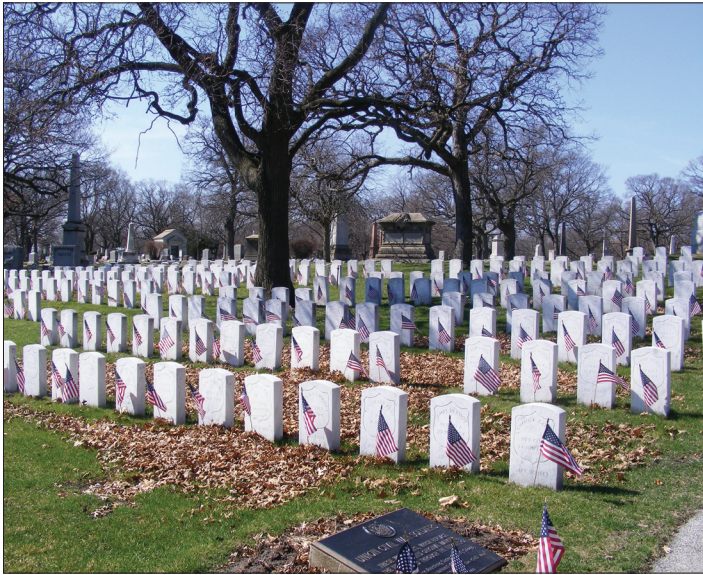
Rows of tombstones mark the graves of more than 100 Union soldiers who died of wounds and disease in an Army hospital on the the South Side. The hospital later became an old soldiers' home, then an orphanage, and is now used as offices by the Chicago Catholic Archdiocese.

Clustered around Alan Pinkerton, the original 'Private Eye, and head of Lincoln's secret service, the 1860s version of the CIA, are Kate Warn, the first female detective who together with Pinkerton accompanied Lincoln to Washington, helping to foil an as-