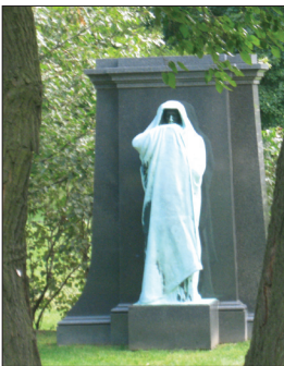
Lorado Taft's iconic “Death.”