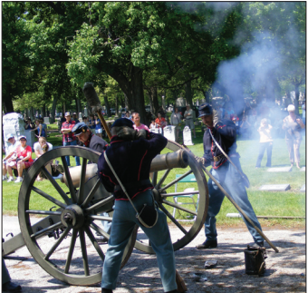
Reenactors fire a salute during Memorial Day services at Rosehill Cemetery.