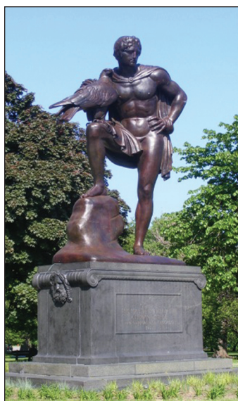
The Goethe monument at Sheridan and Diversey was vandalized during World War I. Read more about life on the "Great War's" home front in our next newsletter.

Other stops will include the graves of Chicago Mayor Carter Harrison, who was assassinated on the last day of the 1893 World's Fair and Alan Pinkerton, an anti-slavery activist and detective who became Abraham