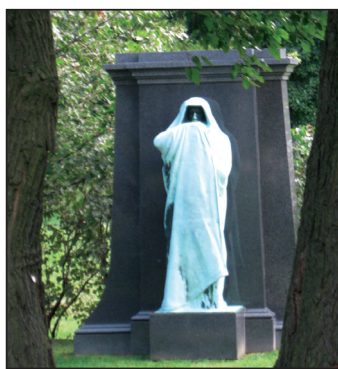
(Left) The Palmer Tomb in Graceland Cemetery. (Right) Lorado Taft's iconic statue, "Eternal Silence" or "Death" is become the symbol of Graceland Cemetery, sometimes called Chicago's "Valley of the Kings."